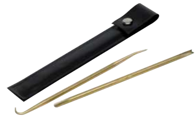
Brass pick and spat shown above.

Note: Private labeling is available upon request.